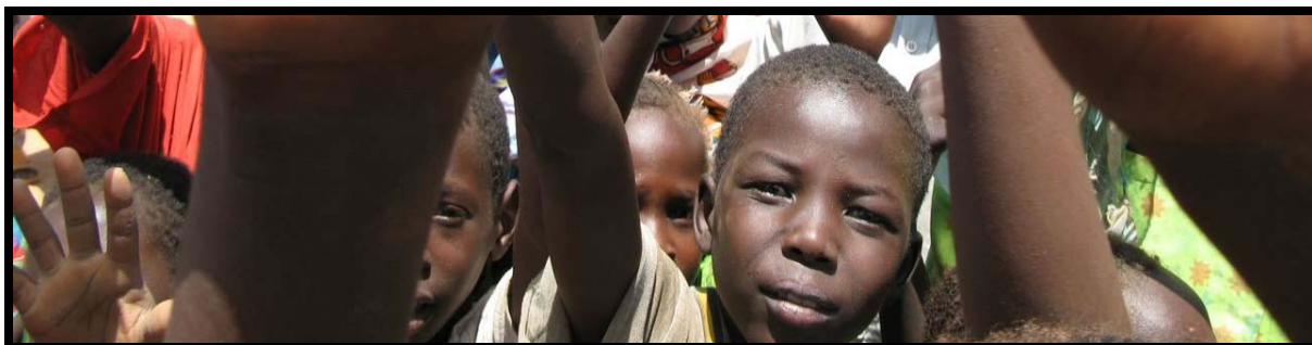
Children in a camp for displaced people in Darfur.

For more than 5 years, the people of Darfur have been under attack. The majority have seen their villages burned to the ground, and their loved ones hurt and killed. Most affected families and communities have nothing to do with the people who are fighting – they are innocents caught in the middle of terrible violence.