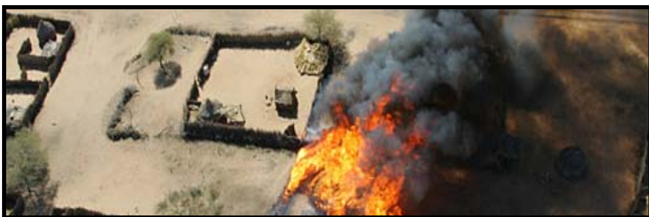
A burning house in a Darfuri village, during an attack.

Darfur is the western region of Sudan, Africa's largest country.