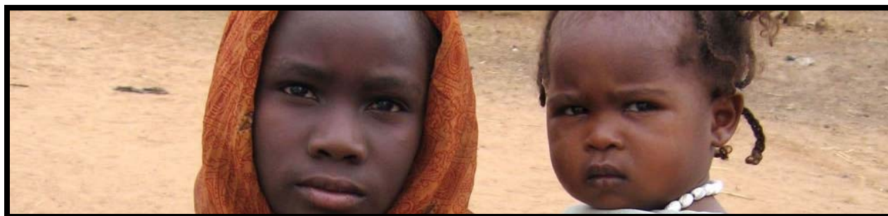
Two Darfuri girls living in a displaced people's camp.

You can also find more information on the www.DarfurChallenge.org website, including pamphlets, answers to frequently asked questions and a constantly updated news feed of the latest developments in Darfur.