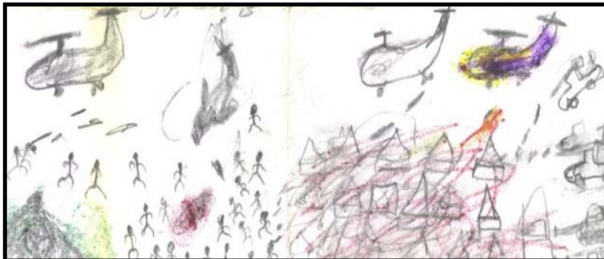
Taha's drawing of the attack on his village.

Life is difficult for kids and their families in Darfur. It is not easy to get essential things like food and water. Children have to help their families to survive, and they do so by collecting supplies like firewood for cooking. It is very dangerous to go out of their camps and villages for what they need, but they often have no other choice.